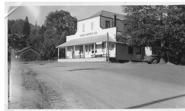
Hugo Supply Company: 1930s