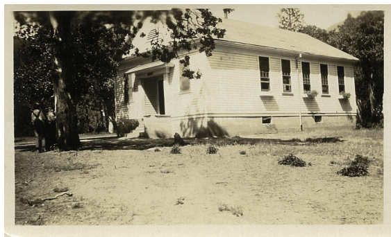
Hugo School: 1926