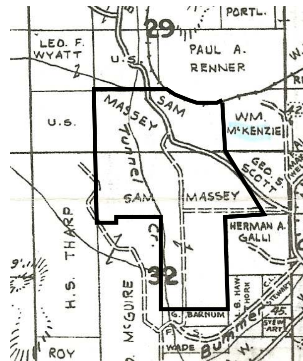
Massey Ranch: 1955