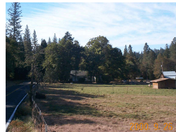
Old Green House (middle in trees) On Bummer Creek, Hugo, Oregon: 2000