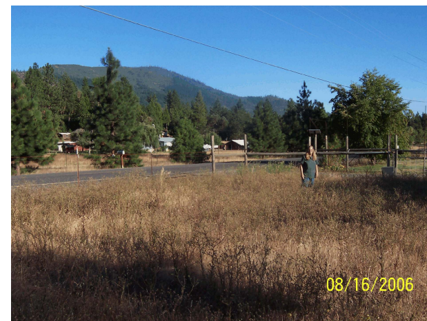
Karen Rose On Fairfield Property Next To Monterico Road