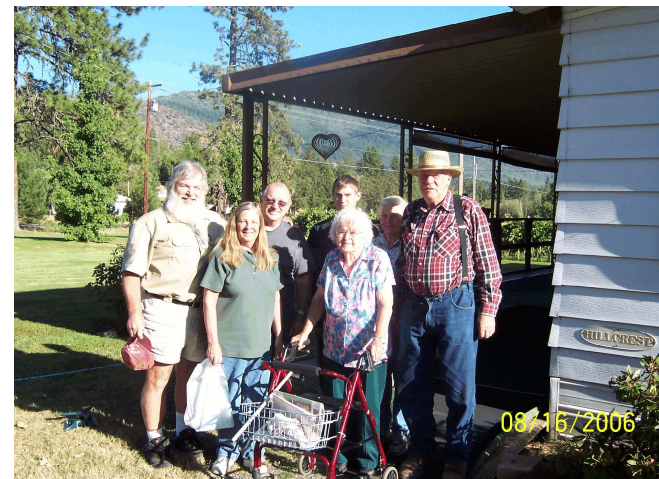
Applegate Trail Field Trip Participants

Stakeholder Alma Fairfield's old home lot (i.e., 5 Acre Tax Lot 600, Section 35C, T.34S., R.6W., W.M.) was so close to the Trail - less than a couple hundred feet. We just did not have the survey information to prove it in 2006.