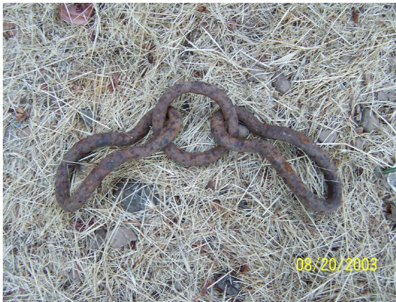
Applegate Trail Ox Yoke Chain Artifact: On Verified Class 3 Segment OR-JA-00-35-06-2- Silvestri Property