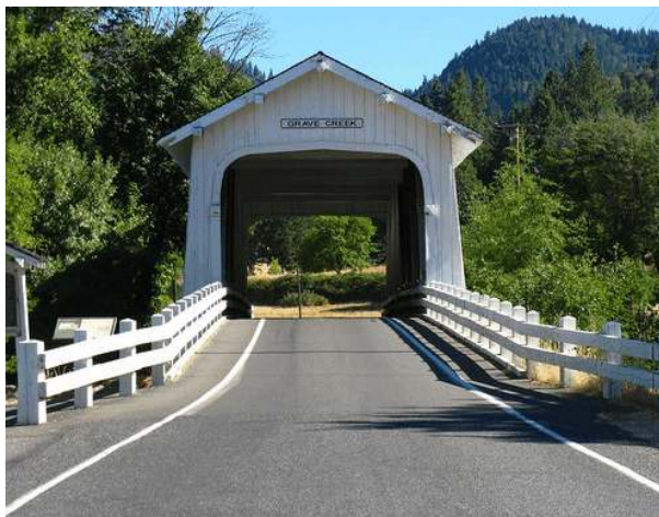
Grave Creek Covered Bridge

Four months later, traffic passed through its portals. The 105-foot Howe truss is supported by "dumb bell" concrete piers. Total cost of the construction, including the engineering fees was $21,128.