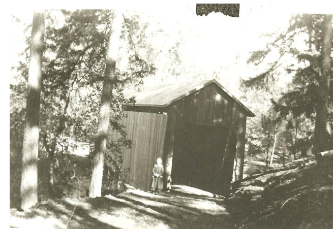
Eva Pollock at Winona Covered Bridge: ca., 1930s