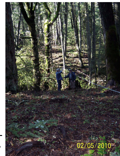
Photo 2. Survey Work Near JA-15