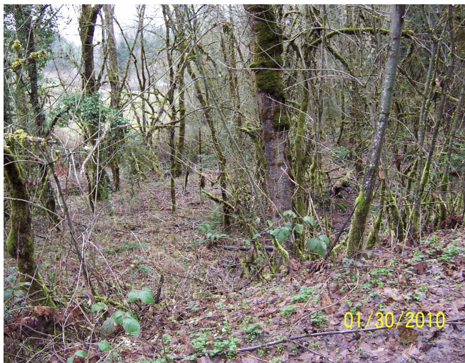
Photo 1. Rat Creek Near JA-16 Old Stage Road