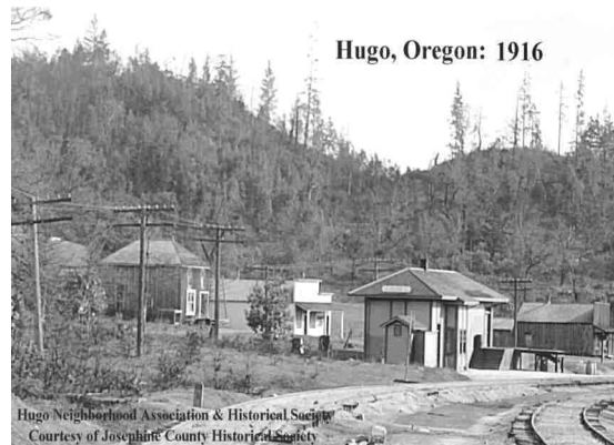
Hugo, Oregon: 1916