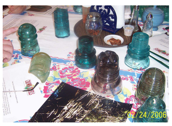
Examples of Josephine County Insulators