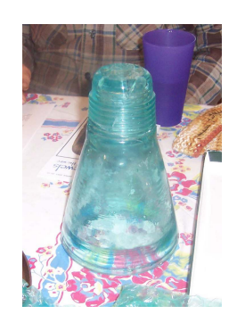
Power Insulator