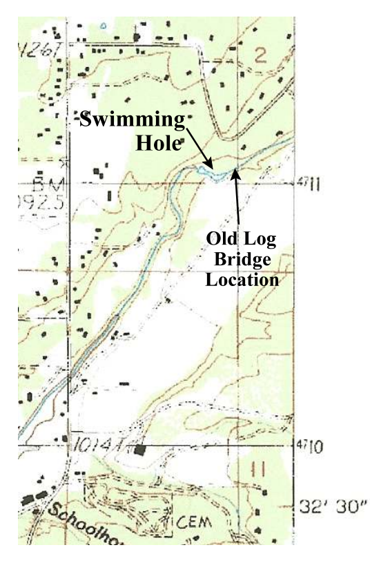
Jumpoff Joe Swimming Hole: 1998