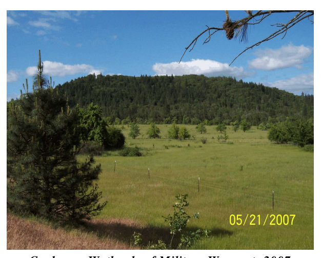
Cochrane Wetlands of Military Warrant: 2007

Natural Prairie & Pasture <sup>6-7</sup> The military patent number 41877 included most of the open wetlands of what would later become part of the 240-acre J. C. Cochrane ranch. The warrant and the ranch's location had a reason: natural sub-irrigation for pasture during the winter, spring, and early summer.