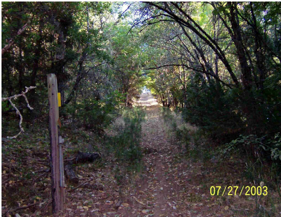
Altered Road on White Property