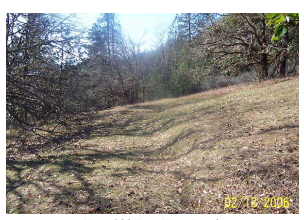
Very Old East-West Road Entire Length Of White's Place

Ann Lyneis, Secretary 5100 Tunnel Loop Road Grants Pass, Oregon 97526