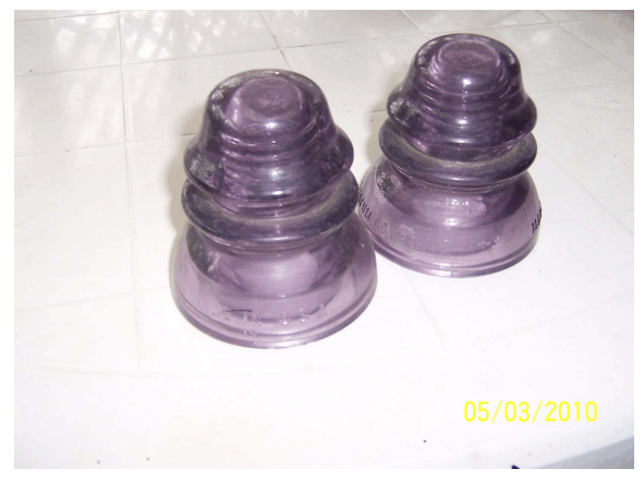
Claude's Purple CD 154 Whitall Tatums

Dunivin's Retreat Insulators The dominant insulator at Dunivin's Retreat is the Hemingray "Double Petticoat" No. 42. Other insulators include the Hemingray #40 and 42, some have May 2 1893 embossed; Spiral Groove" Brookfield CD 147 October 8 1907 embossed; H.C.Co (Hemingray), Star and Mcloughin from San Diego; odd ceramic or maybe porcelain insulators (see Frommer insulator brochure<sup>3</sup>).