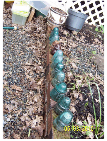
Outdoor Merlin Insulators