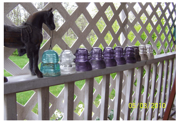
Claude's Merlin Porch Insulators

Insulator Brochure Series This brochure is number 15 of several in the "insulator" series.<sup>2</sup> Most