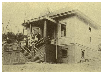
Three Pines School