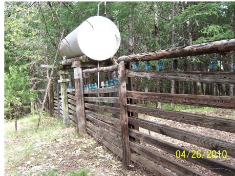
Fence Insulator Display