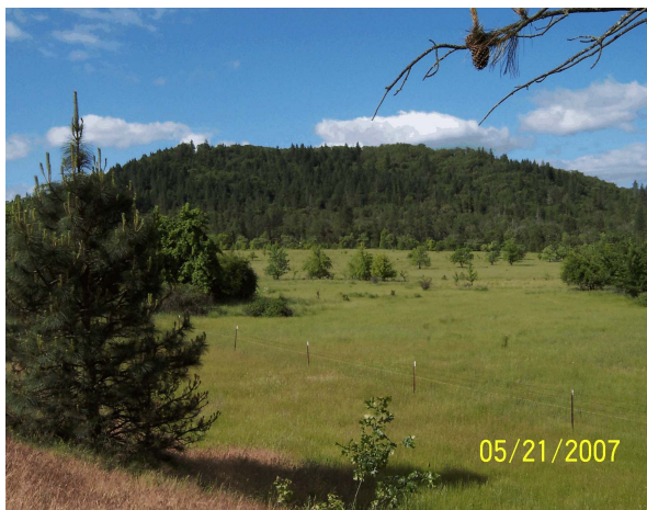
Cochrane Wetlands of Military Warrant: 2007