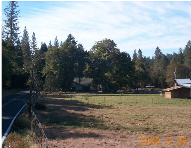
Old Green House (left - center): 2000

1895 By 1895 the Green family owned the Chadwick's land. 3&4