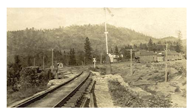
Hugo, Oregon: ca., 1900

The first Hugo Post Office building was a simple affair located within 30 feet of the Southern Pacific Railroad (middle right structure in photograph).