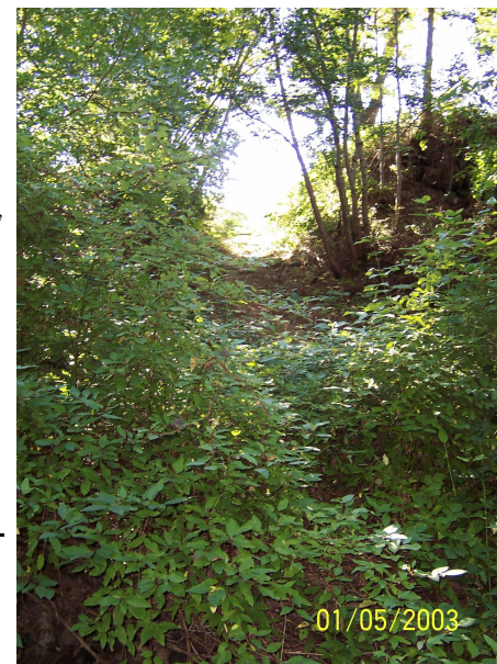
South Ford Entrance To Jumpoff Joe Creek: 09/14/2010