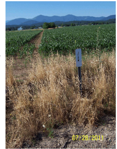
Photo 2. County ROW Monument Looking South

Class ③ Verified Trail, or Class ④ Altered and Verified Trail. 4