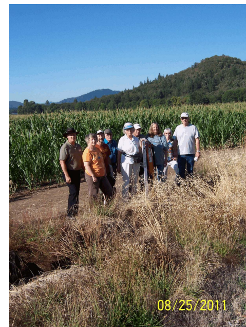
Photo 2. Mapping & Marking Crew At IV-N3B Off Set