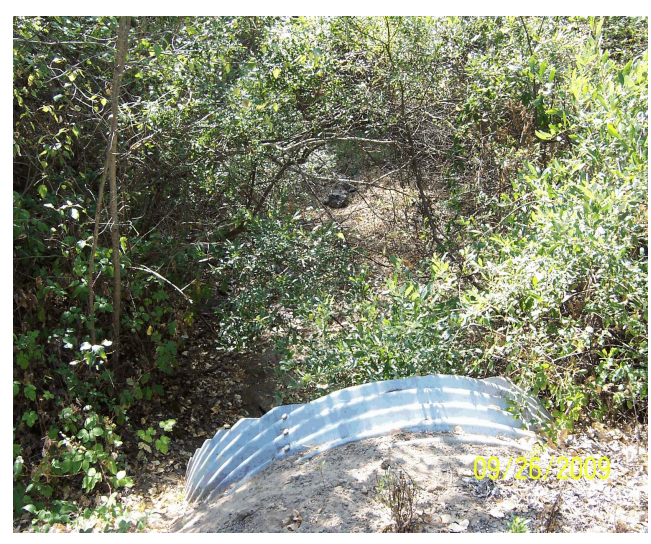
Bannister Creek Culvert Under Hidden Acres Drive

The 1846 IV Ford No. 6 today would have been very near where Bannister Creek goes through a culvert under Hidden Acres Drive approximately 400 feet north of GLO surveyed location IV-4.