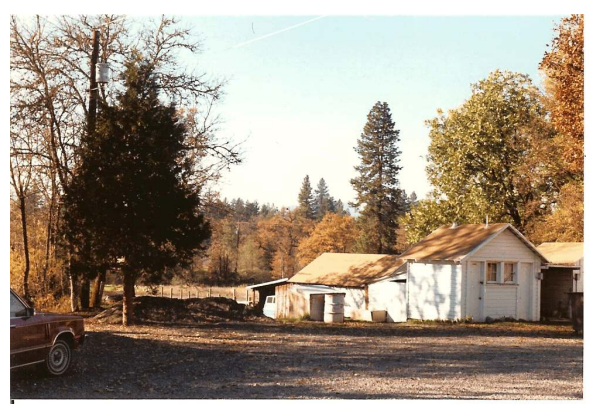
Front Right Building Was Public Restroom

Union 76 Gas Station Except for the two gas pumps there were no Union 76 signs. The big hanging sign advertizing the business was a large RC logo over the words, Antler's Market .