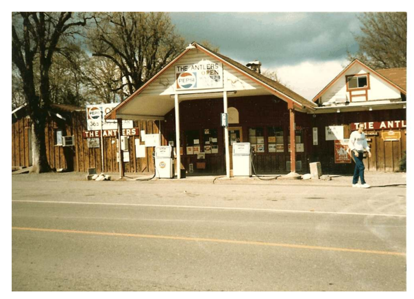
Antler's Store On Monument Drive