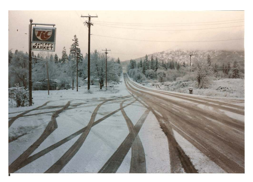
Monument Drive North from Antlers

Union 76 Gas Station Except for the two gas pumps there were no Union 76 signs. The big hanging sign advertizing the business was a large RC logo over the words, Antler's Market .