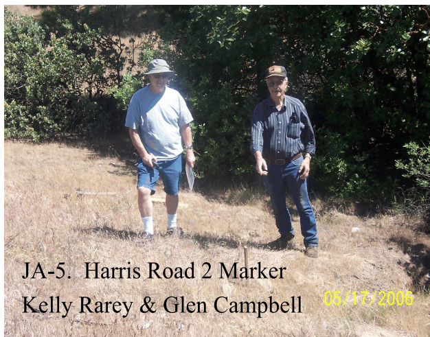
JA-5: Harris Road 2: 2006

1. JA-5 No. 1 Location GLO 22.5 chains = 1,485':