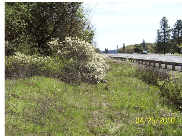
Benched Road Trace North of JA-4

Patent JA-4 is located on the old Harris 320-acre Donation Land Claim (December 9, 1865 Certificate No. 70, OR 06656, PL 167).