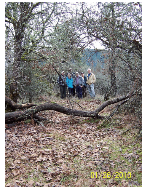
GLO SubCommittee Members With Warren Kendall (tan coat) At Road Trace & Vegetation Differential NW of JA-2