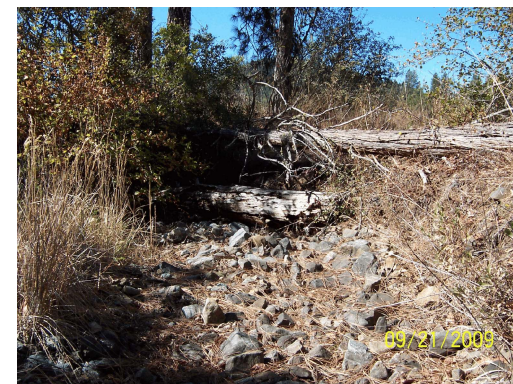
JR Fords No. 4: Harris Creek Ford

Sexton Mountain Quadrangle: 1996 7 The topography is mild at the JR Fords No. 4 (three fords within 80').