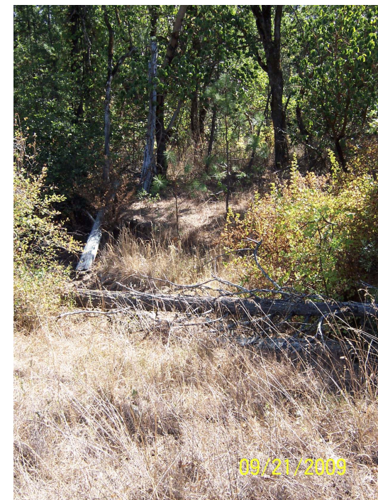
JR Ford No. 4: Harris Creek Ford

September 29, 2009 Updated September 29, 2010