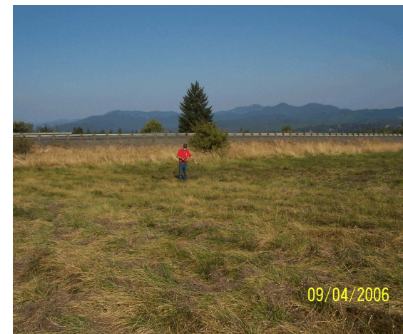
General JA-H-2B Location

JA-H-2B is in the field northwest of the JCSA's office near and west side of the large camp fire rocks. Did not stake with an interpretive sign.