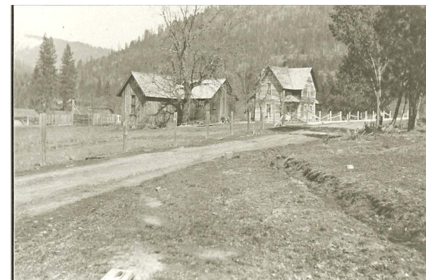
Louse Creek Stage Station: ca., 1865