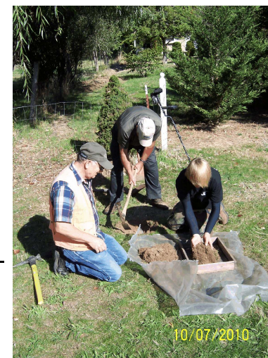
Relics SubCommittee At Shovel Test Pit