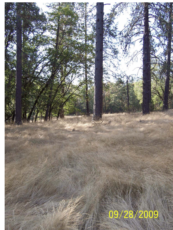
1950s - 1960s Wagon Ruts Were on Both Sides of Middle Ponderosa Pine