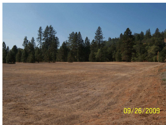
Corliss Creek Is Western Tree Line South of Mt Paradise Drive

The little north-south valley created by Corliss and Bannister Creek as crossed by the Mt Paradise Road is small with the larger Bannister Creek being on the east (Merlin Quadrangle: 1998). Corliss Creek is a blink along the way, but has a culvert under the road for high water events.