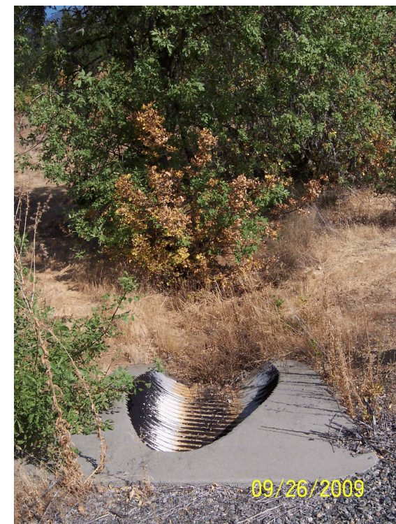
Corliss Creek On North Side of Mt Paradise Drive