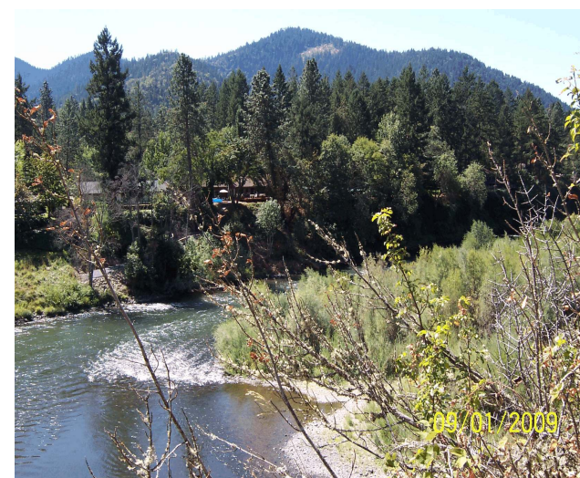
Rogue River's Pearce Riffle Ford: 2009