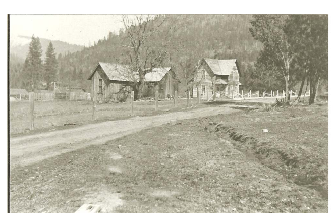
Louse Creek Stage Station: ca., 1865