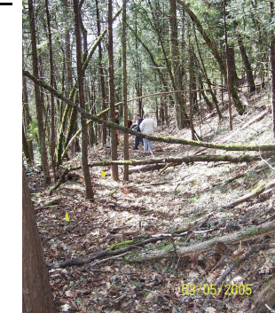
Mt. Sexton Pass Trail

Applegate Trail Diaries, Journals & Reminiscences Project. "Yellow Book Project" For Participants of the Diaries, Journals and Reminiscences Sub-Committee. Hugo, OR; Hugo Neighborhood. 2005 Diaries & Journals. Brochure 11 in Emigrant Trail Series. Hugo, OR; Hugo Neighborhood. 2006 Diaries, Journals & Reminiscences Sub-Committee. Brochure 11B in Emigrant Trail Series. Hugo, OR.