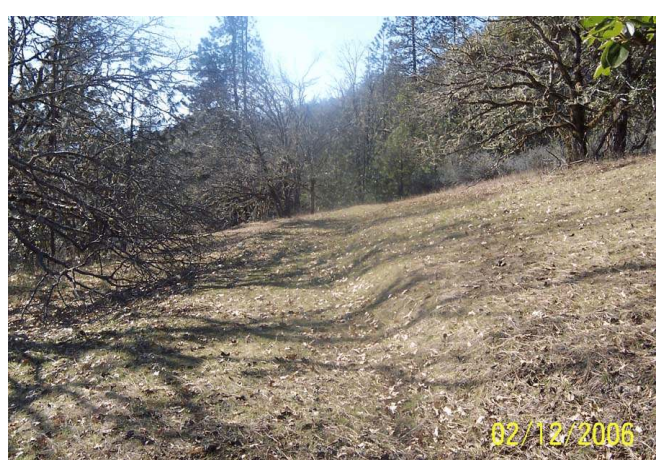
North Oxbow of Applegate Trail