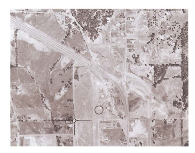
North Grants Pass I-5 Interchange: July 22, 1959

1966 The Oregon Highway Department's construction program hit one of its most significant milestones with the completion of I-5 to four lanes. It marked the first time travelers could enter the state at the Interstate bridge in Portland and head southbound along the high-speed freeway to California without one traffic signal or stop sign. The 308-mile highway was dedicated on October 22, 1966, in ceremonies at the Cow Creek Safety Rest Area in southern Douglas County.<sup>2</sup>