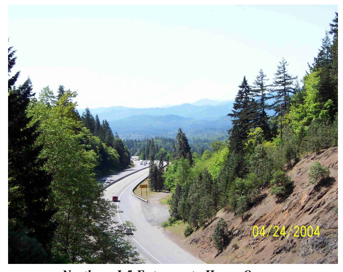
Northern I-5 Entrance to Hugo, Oregon