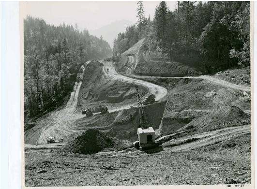
Looking South Toward Mt. Sexton Pass: 1941

1933 Oregon State Police Trooper Burrell M. "Milo" Baucom was killed in the line of duty on July 1, 1933 near Mt. Sexton Pass.