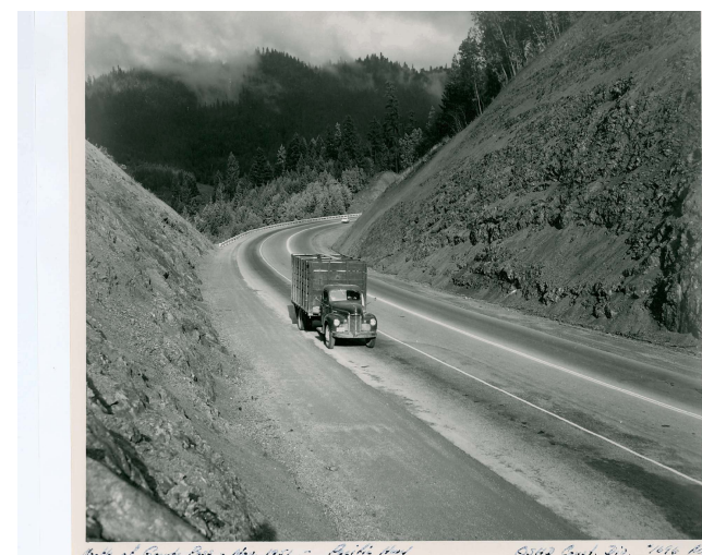
Windy Gap On U.S. 99 South of Mt. Sexton Pass: 1951