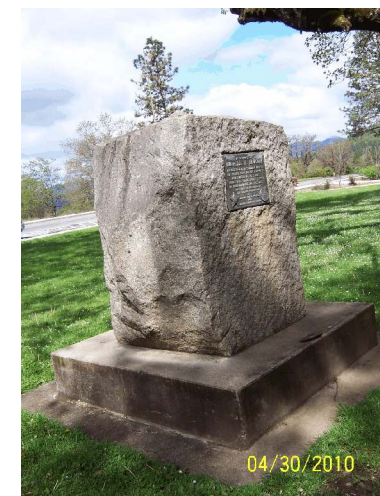
Trooper Baucom Monument, East I-5 Manzanita Rest Area