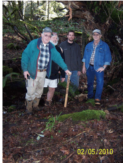
GLO Subcommittee Members At JA-15 South Rat Creek