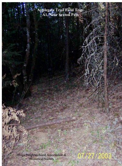
310' South Trail At Sexton Pass: 2003

1940 South Trail At Mt. Sexton Pass The 310' segment of the Trail on the south side of Mt. Sexton Pass is scientifically located by engineers on Oregon Highway Drawing. No. 5B-28-11. 1 The "South Edge" of the 310' segment is located 505' East and 598' south from the 1/4 corner of sections 22 and 23, T.34.S., R.6 W., W.M. The "South Edge" is the middle of the county road where it first intersects the right-of-way for the Pacific Telephone and Telegraph (PTT) line.