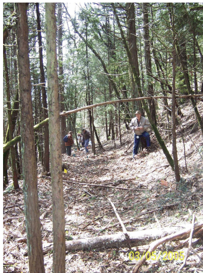
Grade At Mt. Sexton Pass

Topography Maple Creek does not flow north and south at it's further upper reach. It's orientation is finally east toward Sexton Mountain in the vicinity of the 310' segment (see map on title page). The old topography after Maple Creek turns east was probably a north-south restricted draw with seasonal storm waters and sidelining of wagons to the summit. This