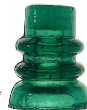
Collins Line Insulator: CD 736

More Information Contact a member of the Hugo Emigrant Trails Committee.