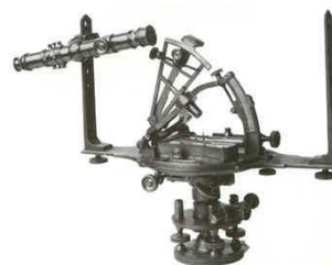
Burt's Solar Compass

Railroad Survey The following quote is from Volume VI - The Pacific Railroad Survey: 1855 5 .