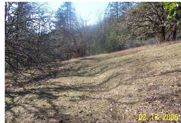
Very Old East-West Road Entire Length Of White's Place