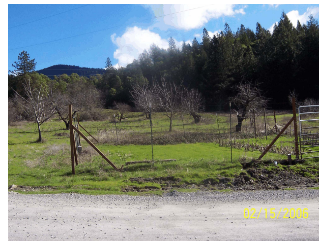
Old Heller Road Located In Echo Cove Orchard, Eastern End In Draw To Penny Ridge Where Mt. Sexton Is In Background