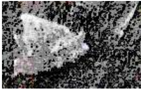
Echo Cove Orchard: 1939

Page 610. Subdivisions of T. 34 S., R. 6 W. S 89° 57', W [West] on true Line between sections 22 & 27.