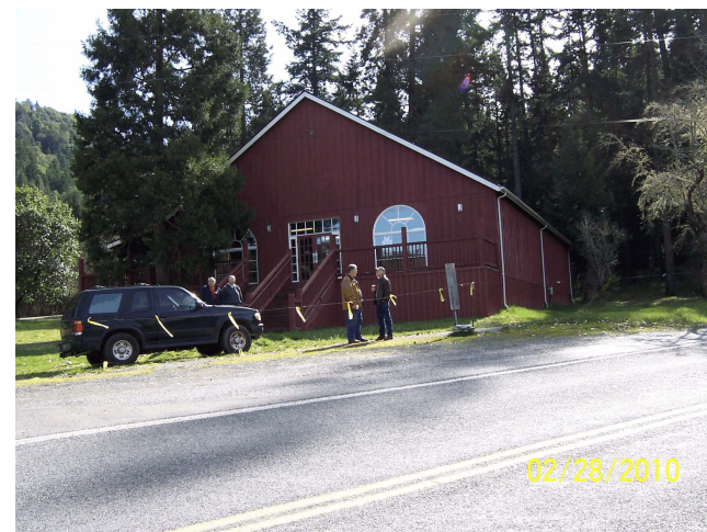
Remodeled Radio Park: 2010

Remodeled Radio Park Josephine County obtained Radio Park through a 1992 tax foreclosure. The property is managed under the terms of a 20-year lease agreement between Josephine County and the Sunny Valley Applegate Trail Society, Inc. that expires in 2015.