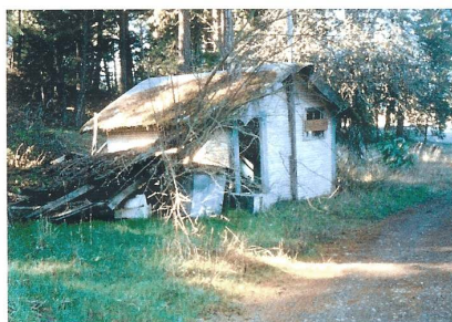
Radio Park Cabin: 1990s