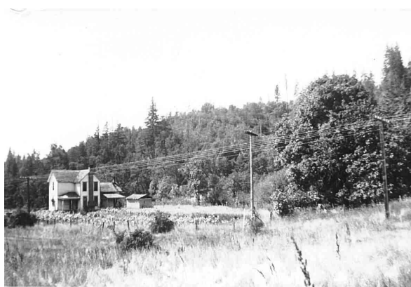
Sexton Place: 1932

"The old Three Pines hotel had a well that was later investigated by oil miners because they had been told that it was a whistling well. A whistling well has gas escaping from the water in the well. In 1932 the oil miners drilled over on the Ludwick property, but never did find anything there. They did not drill on the hotel well site. The oil miners rented the Grimes house in Three Pines during the two years they were drilling until early 1934. During this time the Grimes moved into the old white-painted Sexton house on what is now Oxyoke Road."