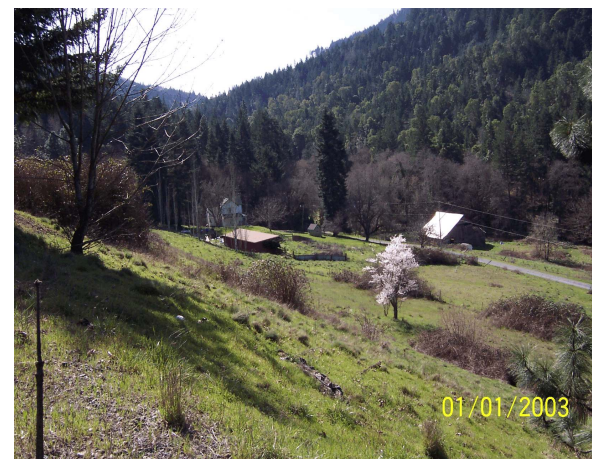
Old Light Ranch: 2003