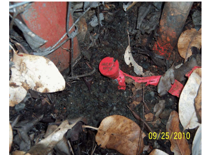
Allen PLS 2757

Surveyor was Peter D. Allen, P.L.S. 2757. He set 5/8" x 30 rebar with red plastic cap marked "Allen - PLS 2757" at FD. 5/8" 1. ROD PER C.S. 136-70 BRS.